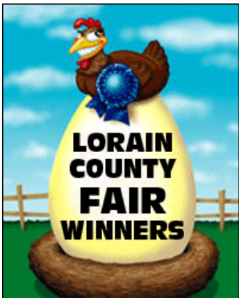
2007 Lorain County Fair Results